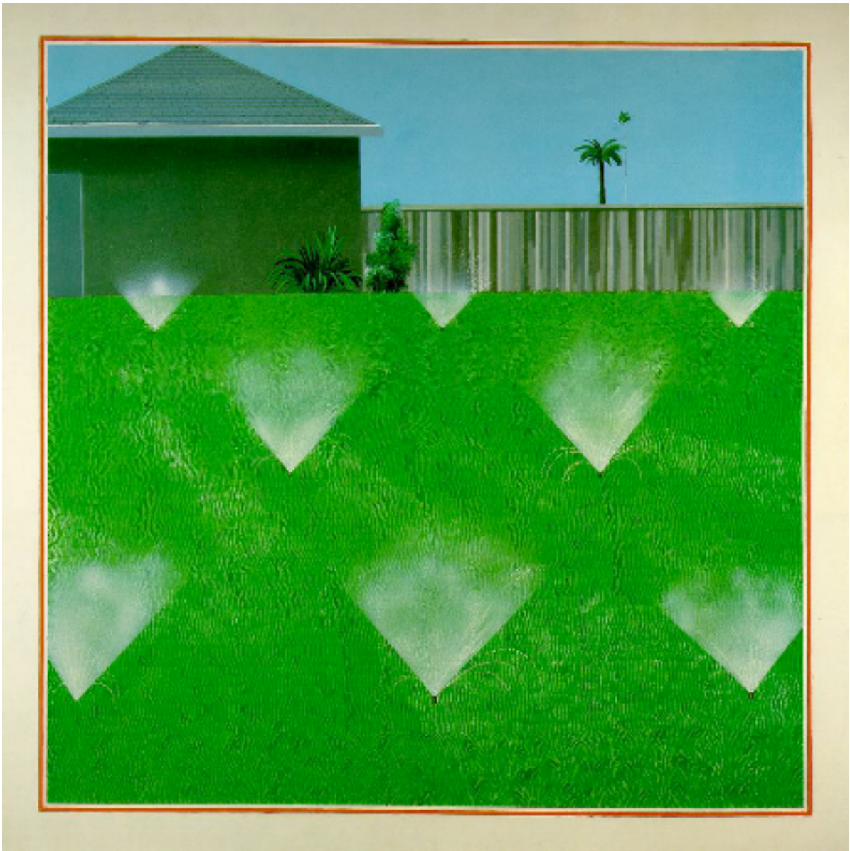
David Hockney A Lawn Being Sprinkled 1967