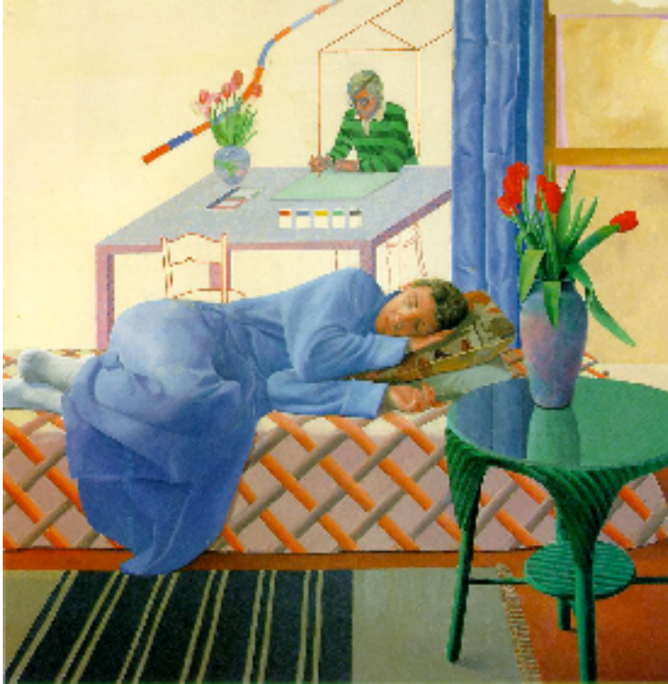
David Hockney Model With Unfinished Self-Portrait 1977